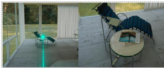
Figure 1 – Dynamic scale representation according to distance

Statement #1 is completely about personal perception of the real scale in VT and whether or not people would consider it easier to perceive scale in 2D viewport or in VR. Most of subjects responded with surprise during second stage concerning their faulty sense of scale and depth (see Figure 1). Two out of eight subjects confirmed that scale in was just like they planned it should be during design process. Comparing to post CAD interview none of the subjects were aware about the scale they were designing in. Nine out of ten subjects confirmed that manipulating with objects in VR would be initially more intuitive considering the relation between objects or between object and avatar. Therefore, both the speed and consideration are more efficient in the self-centered perspective of VR in comparison to the perspective in CAD through flat screen. The final conclusion was that experiment proves statement #1: intuitive perception of scale and other spatial perceptions are better in VR than in CAD.